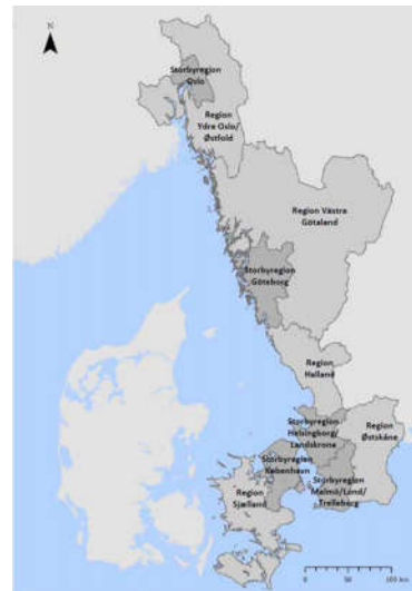
Figure 1. Map of the proposed Scandinavian 8 million City and its 10 administrative regions.

The project clearly reflects the strong interests of the large city-regions - Oslo and Gothenburg, in connection with the construction of an infrastructural corridor that connects the large cities of the region with each other, in order to increase their territorial competitiveness. (COINCO North, 2012) For example, if at the beginning of the project (in 2014), the travel time between Oslo (Norway), Gothenburg (Sweden) and Copenhagen (Denmark) was about 8 hours, by 2021 it was reduced to 4 and a half hours, and by 2025 For the year, there is an expectation that it will only be determined by 2 and a half hours. (Grundel, 2021:863)